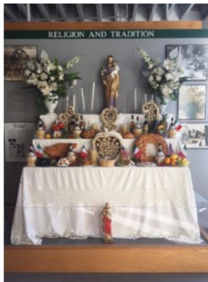
St Joseph's altar at the New Orleans Cultural Center