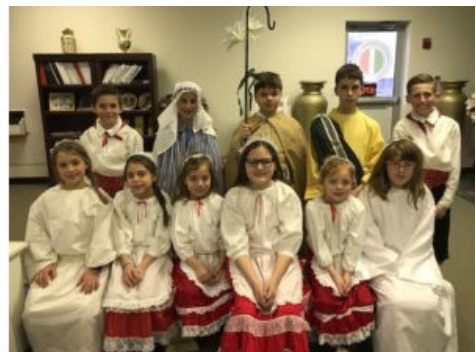
Children dressed as the Holy Family, Angels, and Saints from the 'tupa tupa' presentation