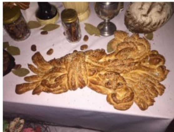
Sheaf of wheat 'vestedde'