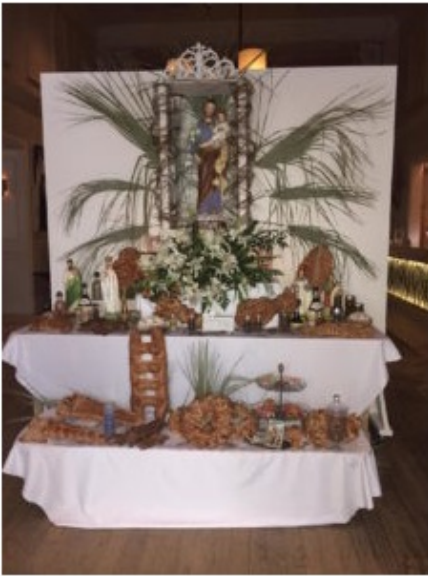
Local St Joseph's Day altar in New Orleans