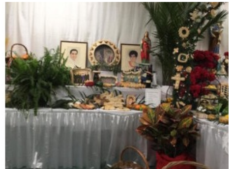
Tumea family altar