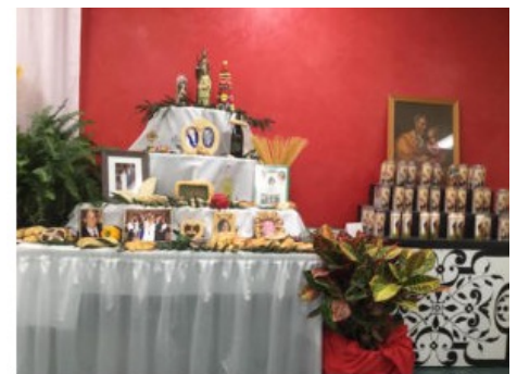
Civitate Family Altar