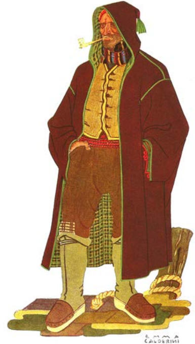
Pescatore adriatico Adriatic Fisherman

Blouse of homespun cloth gathered at the neck and the wrists (sleeves pushed up in the drawing). Vest of cotton, with no collar and no sleeves. Cotton skirt gathered at the waist. Apron of patterned cotton. Also of cotton is the scarf for the hair and the shawl that covers the shoulders (not always worn).