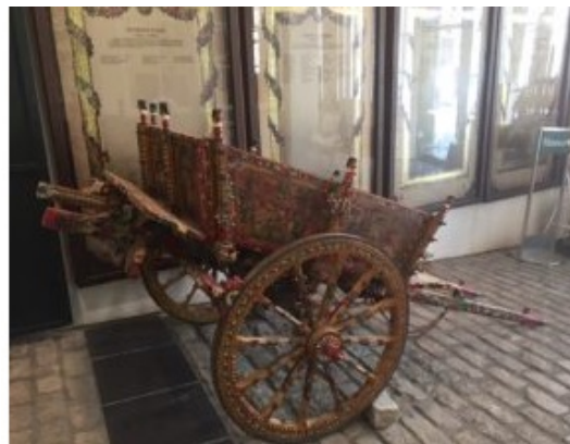
Sicilian cart at the New Orleans Cultural Center

For more information about the American Italian Cultural Center in New Orleans, check out their website: http://americanitalianculturalcenter.com/