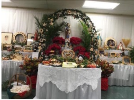
Central St. Joseph Altar

This year marked the 21 st anniversary of the St. Joseph Altar Celebration sponsored by the Italian-American Cultural Center of Iowa. This event was successful because of the many hours that numerous volunteers spent making sure that this would be a truly traditional and spiritual undertaking. Sincere thanks to all those who made it happen.