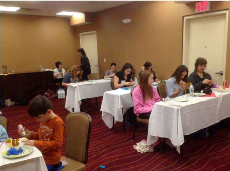
Left: Participants create their own Venetian masks, as modeled below.