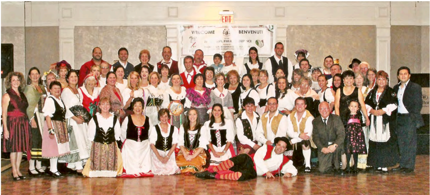
Below: Costumed participants pose for a group photo before entering the Saturday evening banquet.