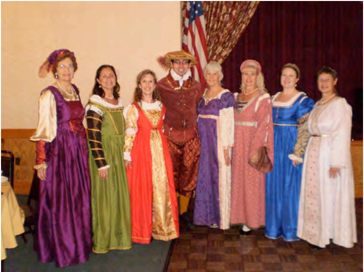
Left: Balliamo dance troupe in their Italian Renaissance costumes.