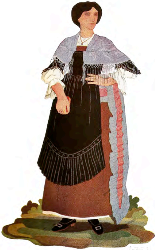
Ragazza di Nicastro in costume festivo

We continue the series of descriptions of folk costumes taken from the book, now out of print, Il Costume popolare in Italia , by Emma Calderini, published by Sperling & Kupfer, Milano. In this issue, we highlight two costumes from the region of Calabria .